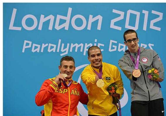
Daniel Dias, gold in the men's 50m Free s10