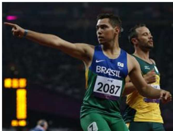
Alan Fonteles Cardoso Oliveira wins against Oscar Pistorius in the men's 200m